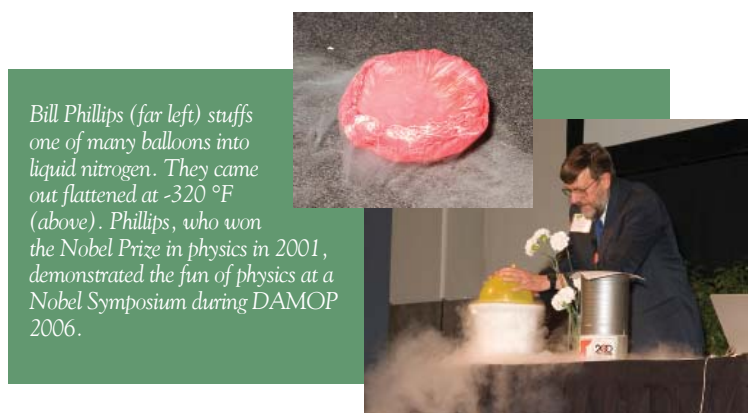
Bill Phillips (far left) stuffs one of many balloons into liquid nitrogen. They came out flattened at -320 °F (above). Phillips, who won the Nobel Prize in physics in 2001, demonstrated the fun of physics at a Nobel Symposium during DAMOP 2006.