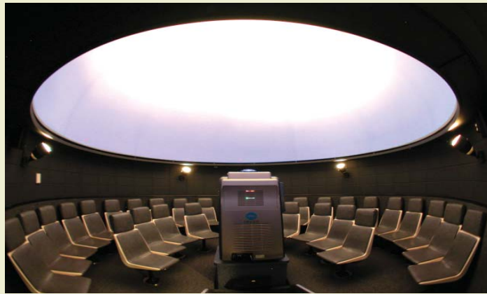
A planetarium at The Science Center in St. Petersburg, Florida, similar to the one envisioned in our department.

into other areas of astrophysics, cosmology, or even observational astronomy. An endowed chair is a large monetary commitment, so we are also looking for donors for junior level chairs, where the yield from the endowment would be used for a substantial salary increase and research funds for an outstanding junior level professor.